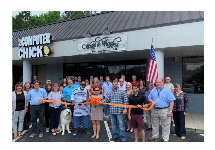
On June 7th, IN WDSTK held a ribbon cutting to celebrate the grand opening of Wags & Wiggles Pet Boutique in Downtown Woodstock.