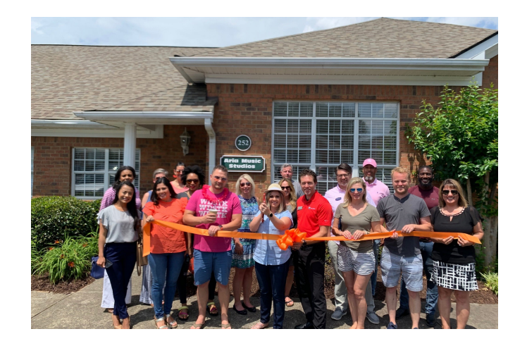
On May 27th, IN WDSTK held a ribbon cutting to celebrate the grand opening of Aria Music Studios, Inc. new location in Woodstock.